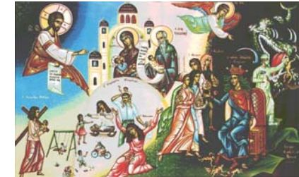
A Modern Icon-like drawing on Abortion.

Lectures will be given for 4 weeks in a pace of 2 lectures weekly, Every Monday and Thursday from 3:00 p.m. till 4:30 p.m.